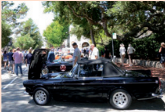
Tigers in Carmel during the Monterey Car week

Thanks to members of STOA and CAT for their help and support